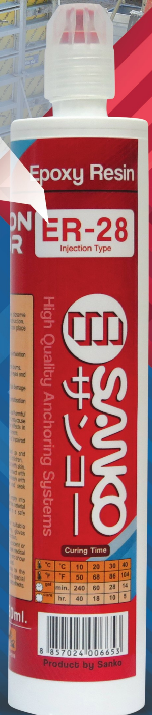
Full curing time ready to work